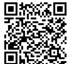
Time recording link

Time recording link (or use the QR code to the right)